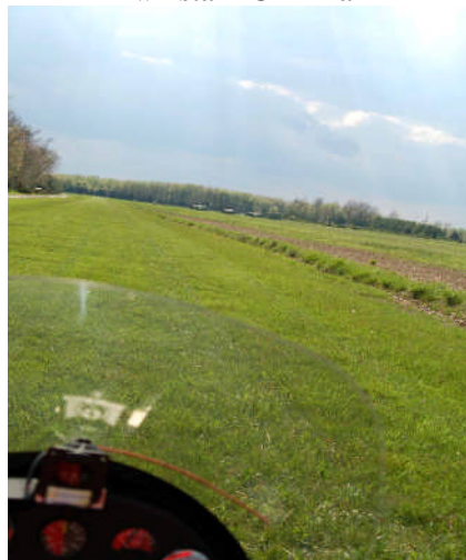
Ready to Takeoff from Clearwater!