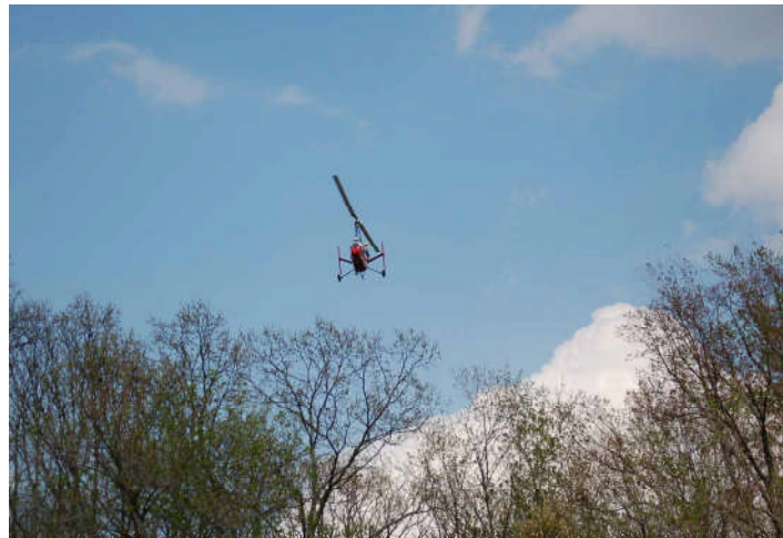
Twinstarr On Final